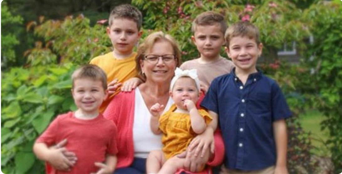
The light of her life